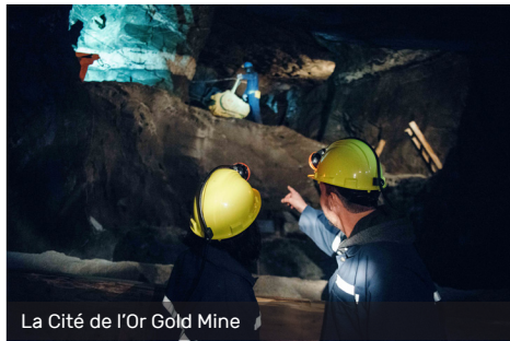
La Cité de l'Or Gold Mine