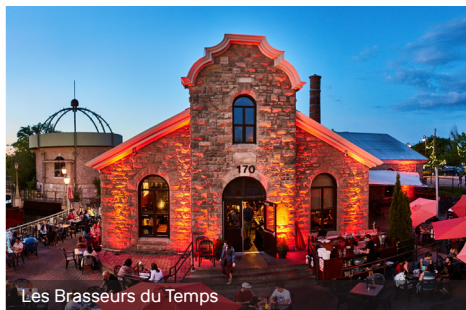
Les Brasseurs du Temps