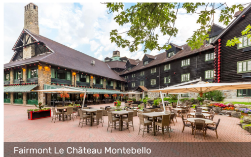
Fairmont Le Château Montebello