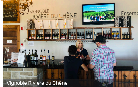
Vignoble Rivière du Chêne