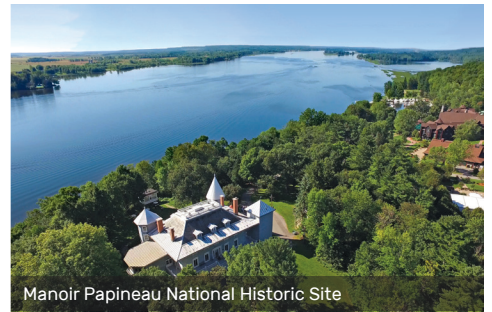
Manoir Papineau National Historic Site