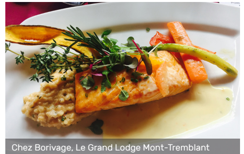
Chez Borivage, Le Grand Lodge Mont-Tremblant