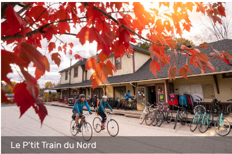
Le P'tit Train du Nord