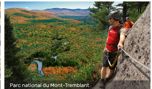
Parc national du Mont-Tremblant