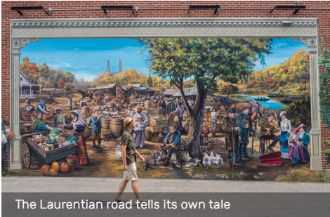
The Laurentian road tells its own tale