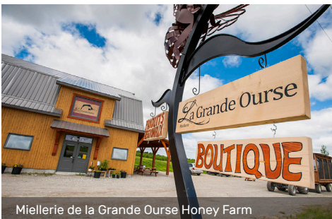
Miellerie de la Grande Ourse Honey Farm