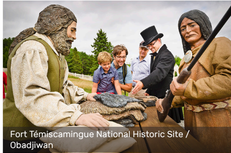
Fort Témiscamingue National Historic Site / Obadjiwan