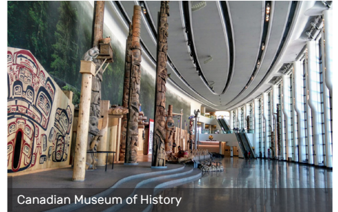
Canadian Museum of History