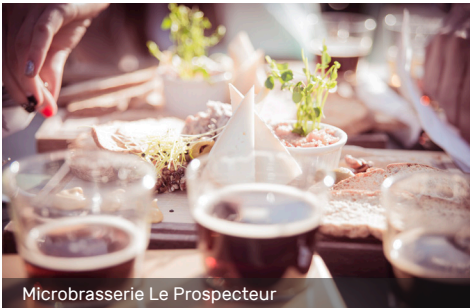
Microbrasserie Le Prospecteur

Follow in the footsteps of past and modern-day explorers. Discover how Quebec and Canada developed. Be moved by the astonishing history of the First Nations, the coureurs des bois and French Canadians you will learn about at the museums, historical and heritage sites. Aboriginal culture, the fur trade, log drives, the railroad, an old gold mine, and sugar shacks are just some of the attractions that will give you a better understanding of these regions that today have a rich and authentic culture—one that is singularly eccentric! Discover the culture of Abitibi-Témiscamingue through its festivals and the warm welcome you will receive from the people of Western Quebec!