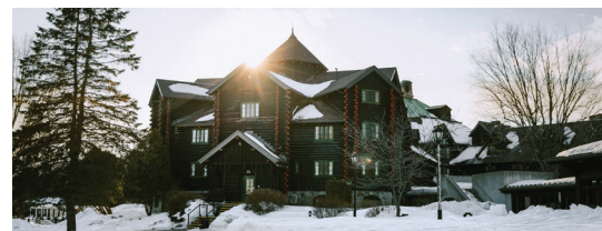
Fairmont le Château Montebello – 210 units