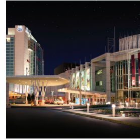
Lac-Leamy Complex with 5-star hotel, casino, spa, theatre, restaurants