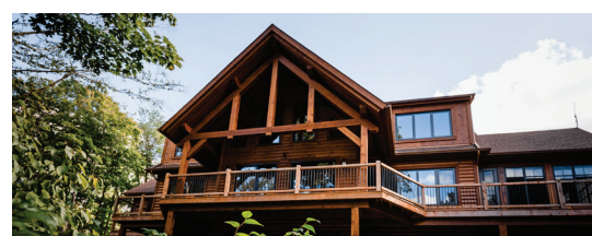
Kenauk Nature (Montebello) – 17 chalets