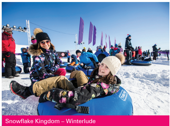
Snowflake Kingdom – Winterlude