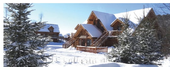
Auberge Couleurs de France (Duhamel) - 20 units