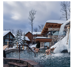
Nordik Spa-Nature: The largest spa in North America