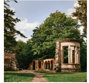
Parc de la Gatineau: 361km 2 – year round activities