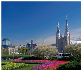
Canadian Tulip Festival