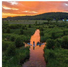
Eco-Odyssée Nature Park: Unique water maze