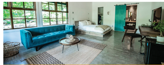
Lofts du village (Chelsea) – 21 units