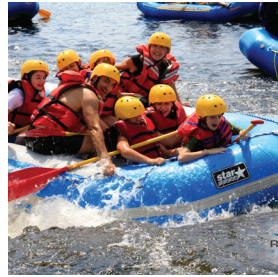
Rafting, canoe, kayak et other water activities