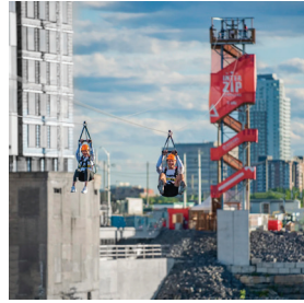
Interzip Rogers: the first interprovincial zipline in the world