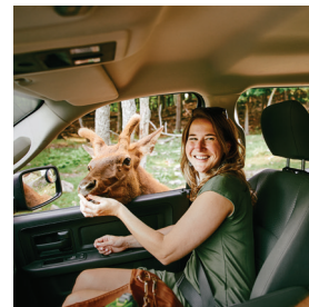
Parc Oméga: Discover Canadian wildlife on 15 km of winding roads