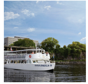
Ottawa River by boat, amphibus, aqua-taxi