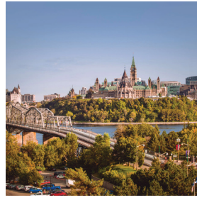
Next door to Ottawa: Parliament Hill, Rideau Canal, ByWard Market, Rideau Hall, Rideau Falls and more