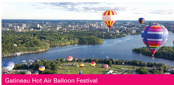
Gatineau Hot Air Balloon Festival