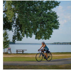
Over 600 km of cycle paths