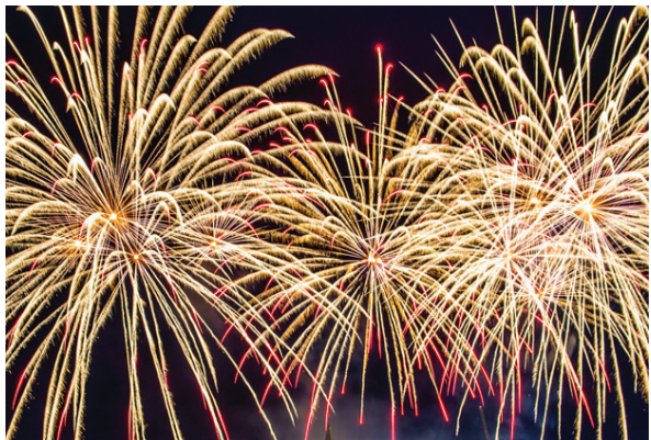
Casino Lac-Leamy Sound of Light

In the Outaouais, we have lots of reasons to get together and celebrate. Slide, skate, and bite into a BeaverTail pastry at Winterlude and the Snowflake Kingdom. Be dazzled by spectacular fireworks at the Casino Lac-Leamy Sound of Light, and let your imagination soar at the Gatineau Hot Air Balloon Festival.