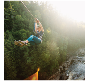
3 aerial parks: Camp Fortune, Arbraska Lafleche and Chutes Coulonge Adventure Park