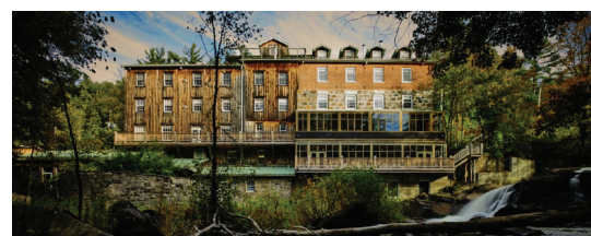
Wakefield Mill Hotel & Spa – 42 units